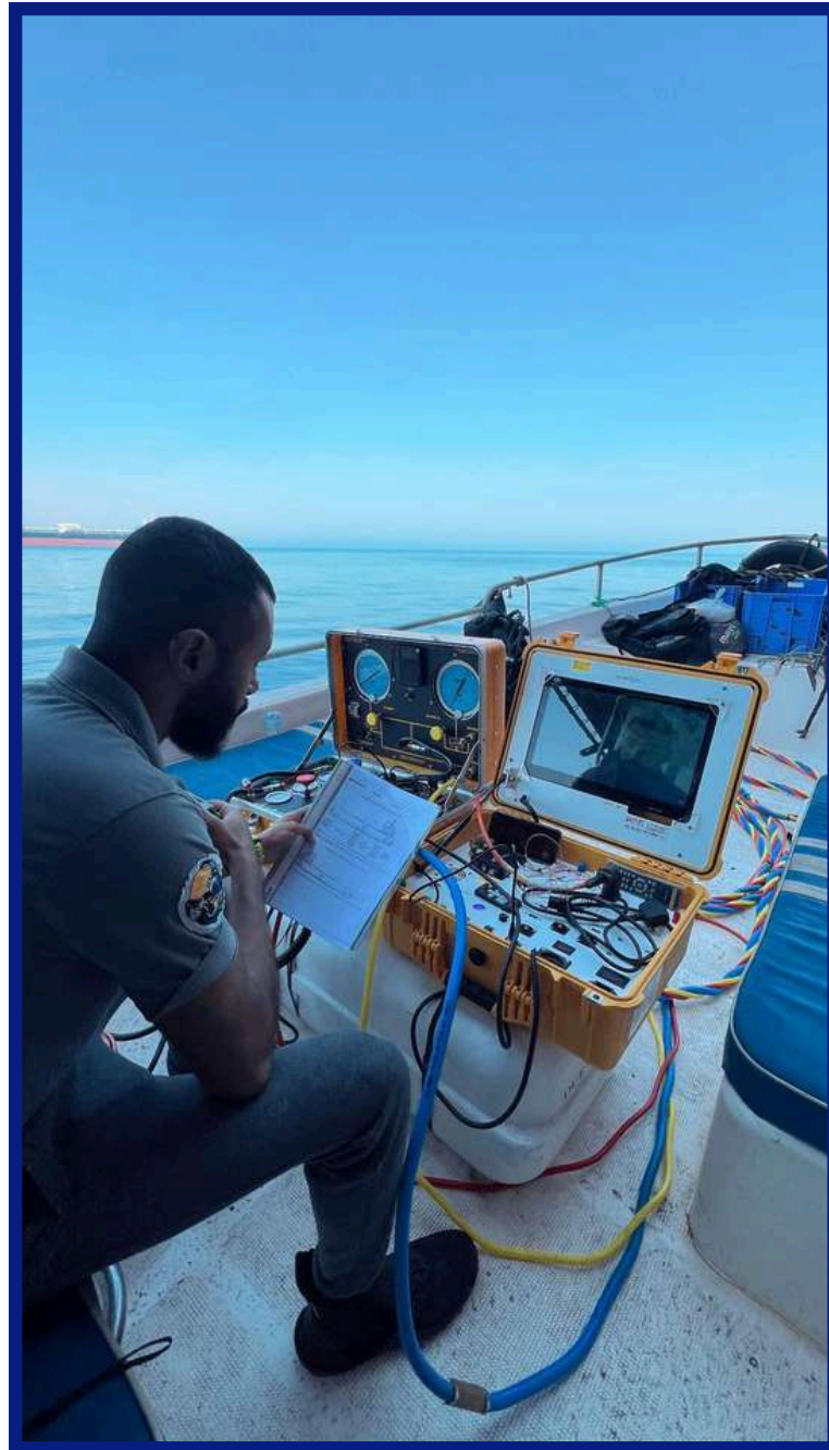
SURFACE SUPPLY DIVING OPERATIONS