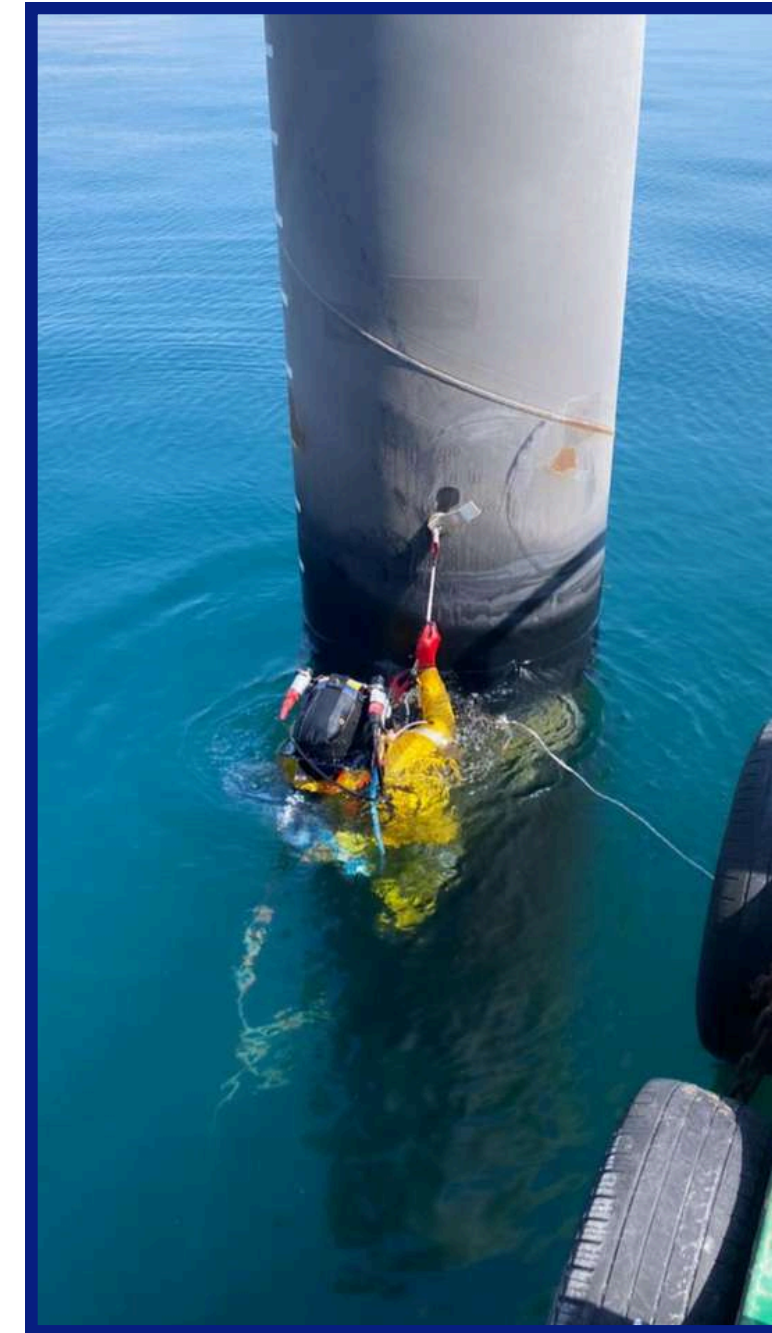
ANODE INSTALLATION ON A PILE