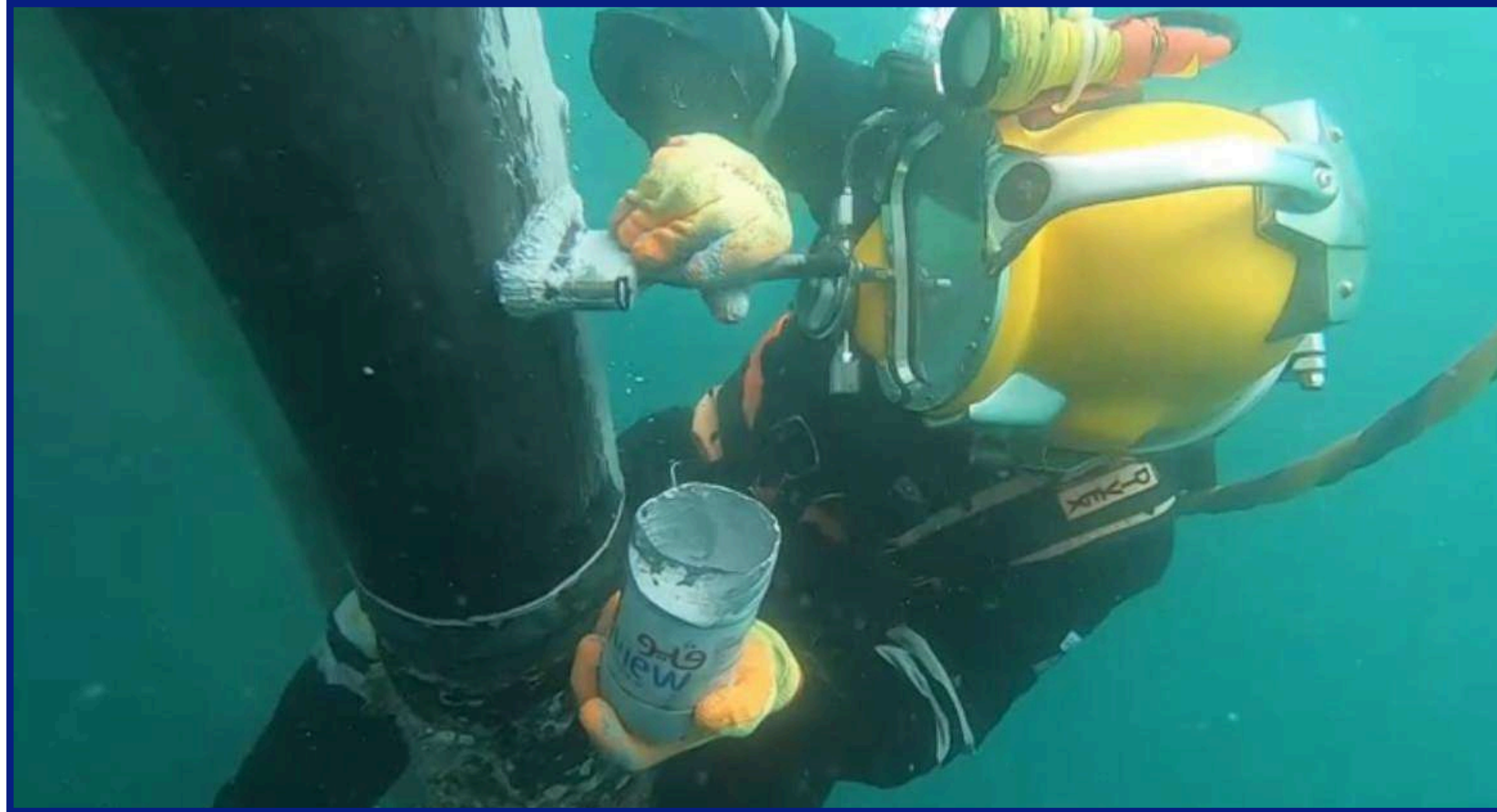
UNDERWATER COATING PROTECTION FOR OIL AND GAS RISERS